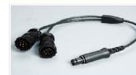
Electronics waterproof wire connector cable