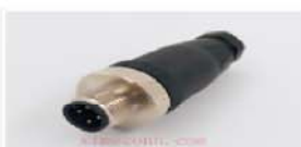
M12 Field Wirable Assembly