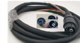
Industrial IP69K IP68 Sealed connectors