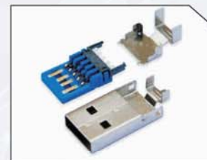
USB 3.0 A M 扁线型三件式