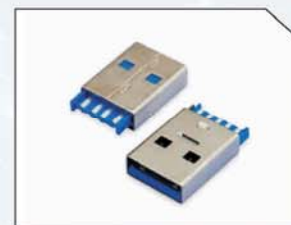
USB 3.0 A M 一体式