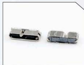
MICRO USB 母头3.0