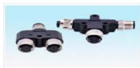
M12 Y Connector