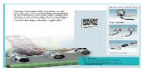
M12 Operating standard