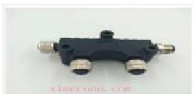
CAN BUS 3-way distributor