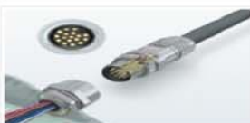
CAN BUS & Ether Net CABLE