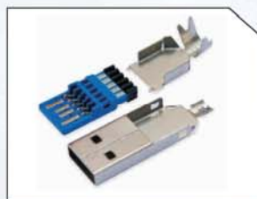
USB 3.0 A M 三件式带线夹