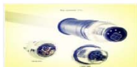
M12 connector 4pins power and 4pins signal