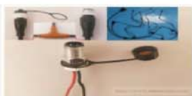
M12 splitter IP68 cable display screen power