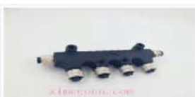
CAN BUS 5-way M12 adapter