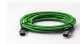
Industry m12 cable IP68 D coding High flexible 5GB network cable