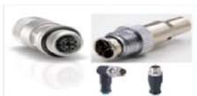
Industrial M12 8pins X-coded crimping terminal connector

XM ® 深圳市西米连接科技有限公司 XIME CONNECTOR TECHNOLOGY CO. LTD