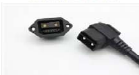
Energy battery 2-6 Storage hybrid Connector