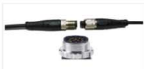
M12 connectors A coding and D