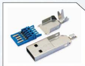
USB 3.0 A M 焊线三件式