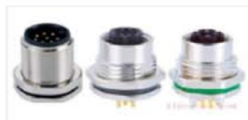
M12 Panel mount Connector