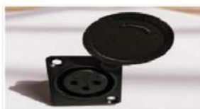
Industrial XLR head socket 3pin soldering with IP54 cap