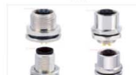
Industrial M5 connector 4pins